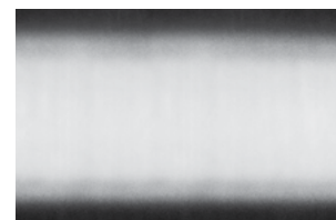
Latex paint through a HEA 517 tip at 1,000 PSI