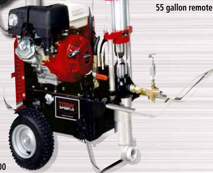
Hydra M 2000