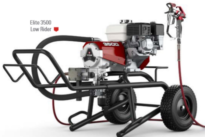
Elite 3500 Low Rider