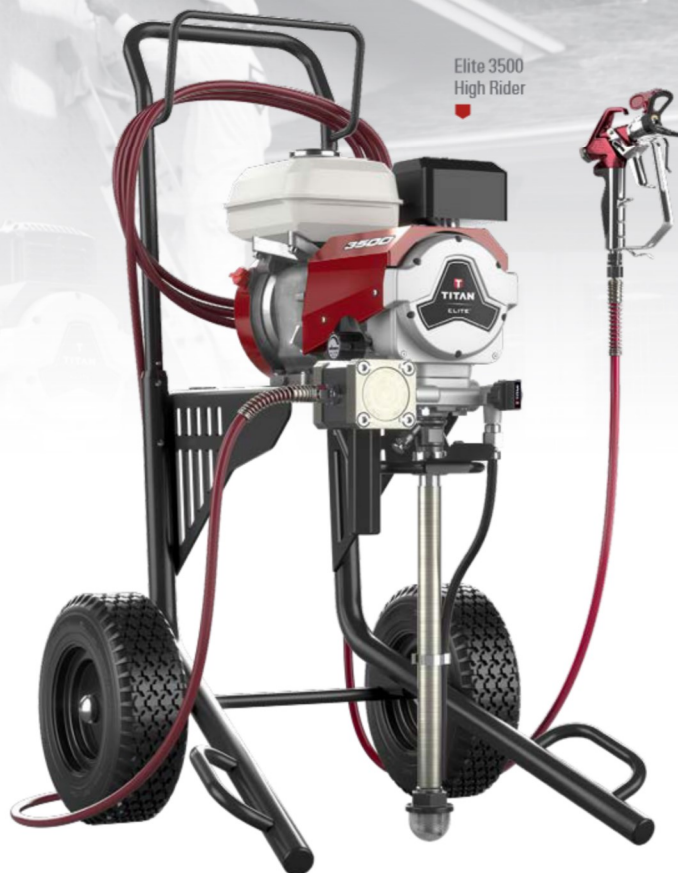
Elite 3500 High Rider